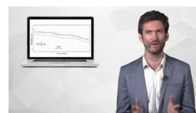
Permasense Corrosion Monitoring