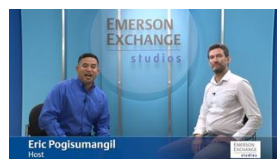
Wireless Corrosion Monitoring Supports Safe and Profitable Operations