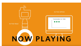
Corrosion Erosion Monitoring in Offshore Installations with Rosemount™ ET210 Sensor System